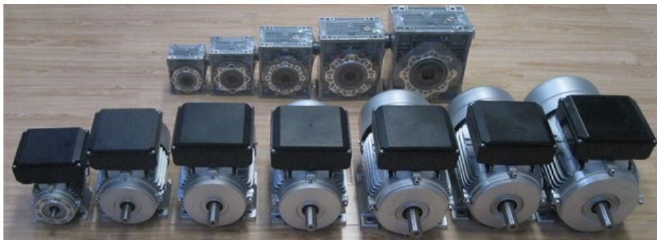
Three Phase 1.5kW 2HP 35rpm Electric Motor and Worm Gearbox Drive