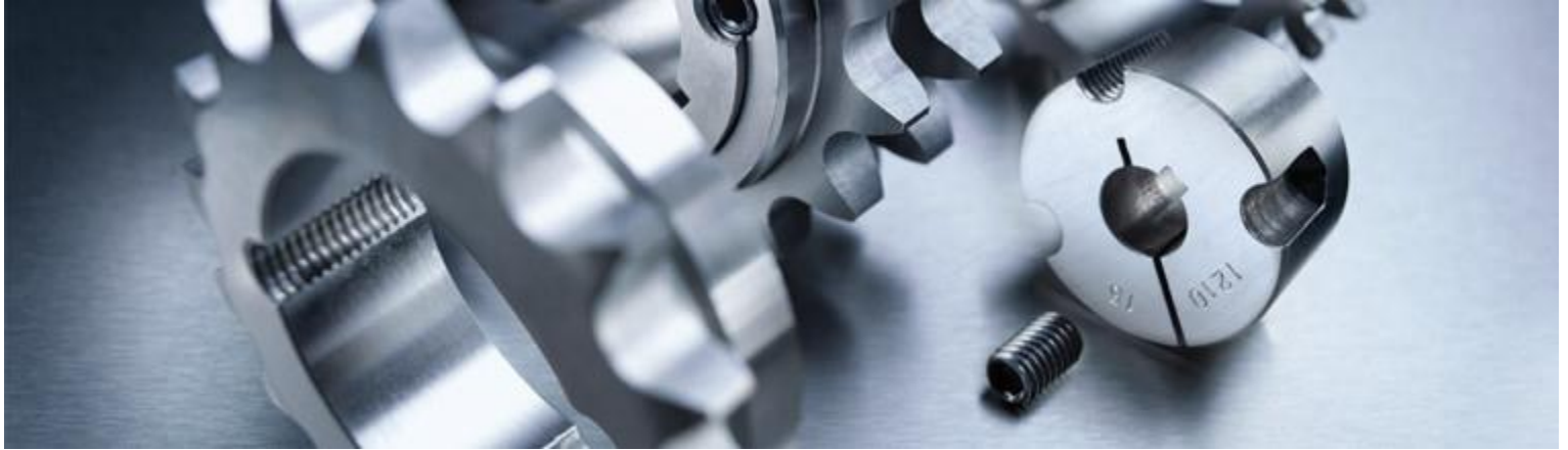
Plate Wheel Sprockets

British Standard high quality steel sprockets. Complete with induction hardened teeth, thus improving the sprockets resistance to wear and increasing the sprockets working life.