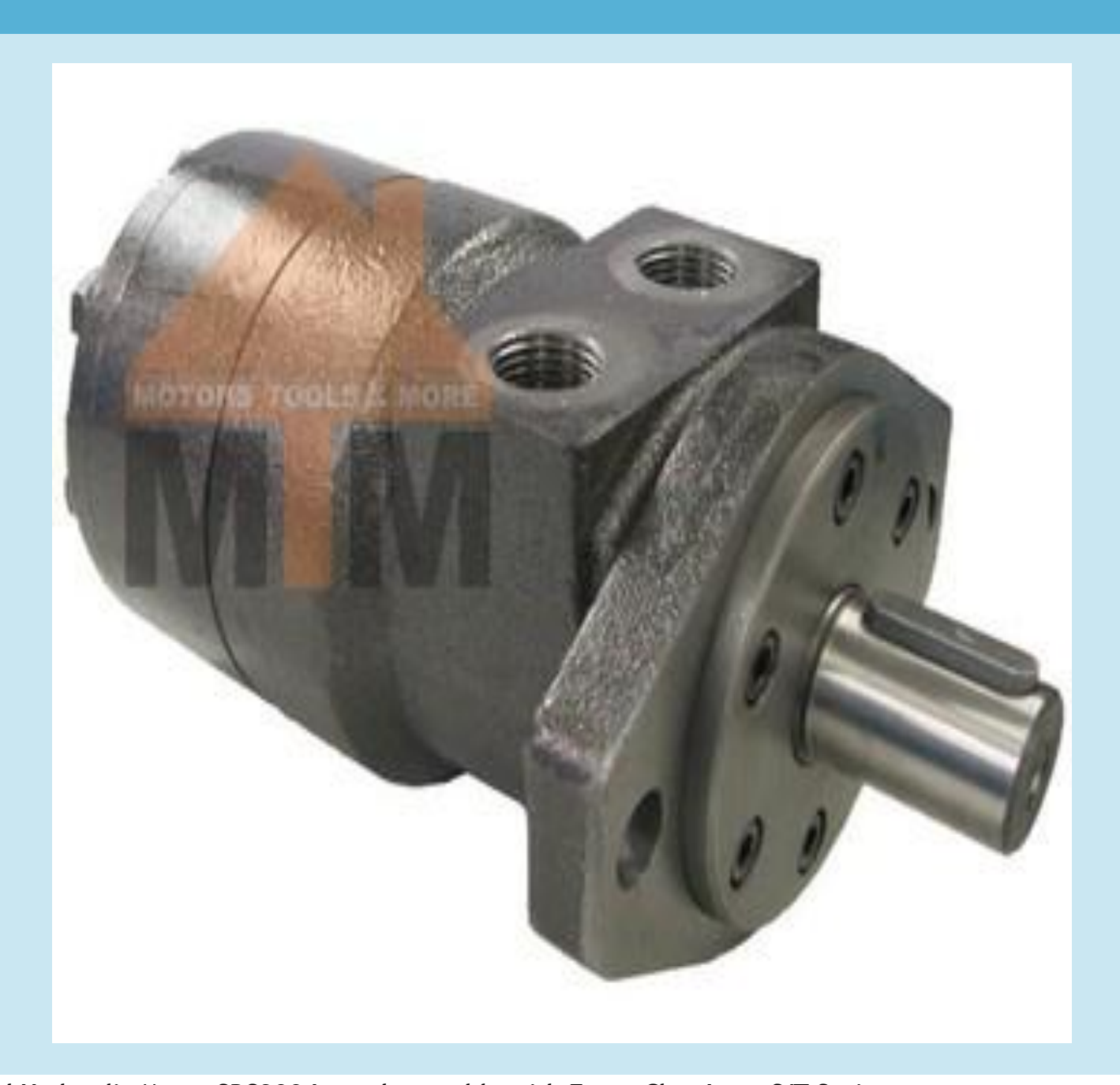
Orbital Hydraulic Motor SDS200 Interchangeable with Eaton Char Lynn S/T Series