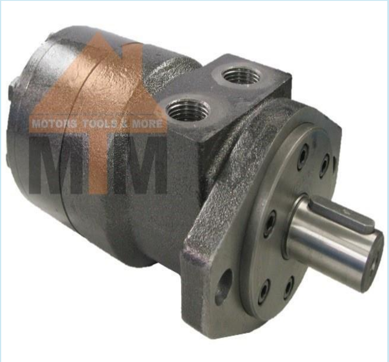
Orbital Hydraulic Motor SDS160 Interchangeable with Danfoss DS, White Cross RE