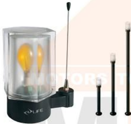
Light and signalling systems