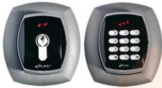
Key and digital selectors