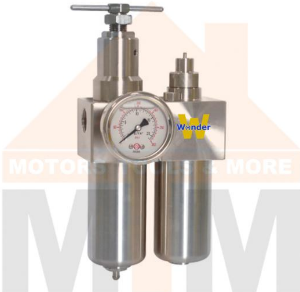
Filter Regulator + Lubricator