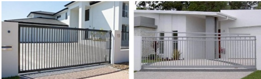
Slide Gate Motor - 600kg Slide Gate Opener