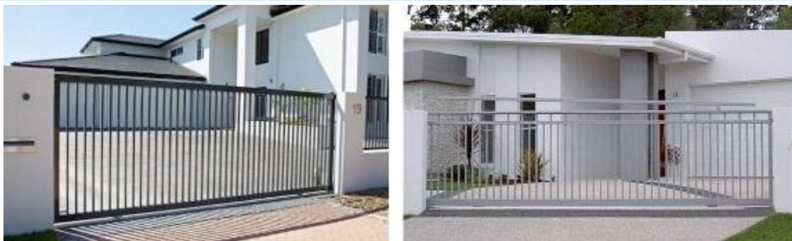
Slide Gate Motor - 600kg Slide Gate Opener with Courtesy Light