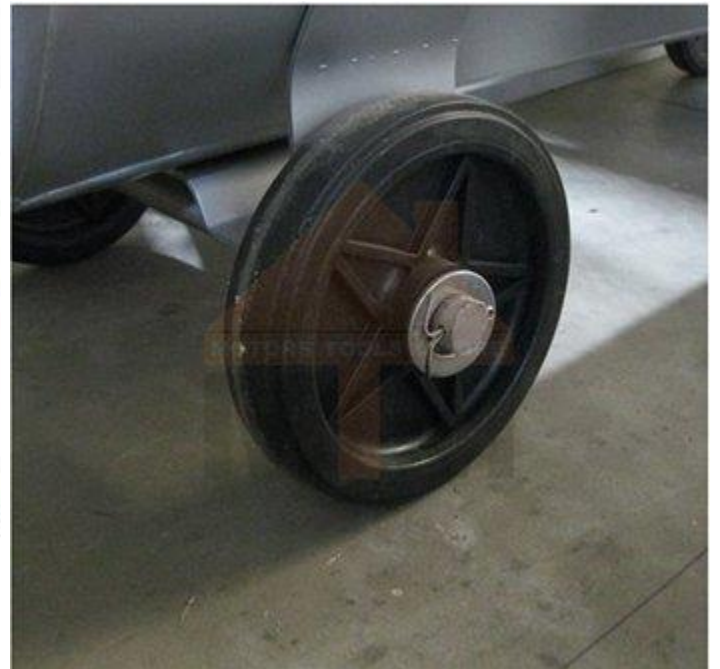
High Power Single Phase 240V 4HP Motor