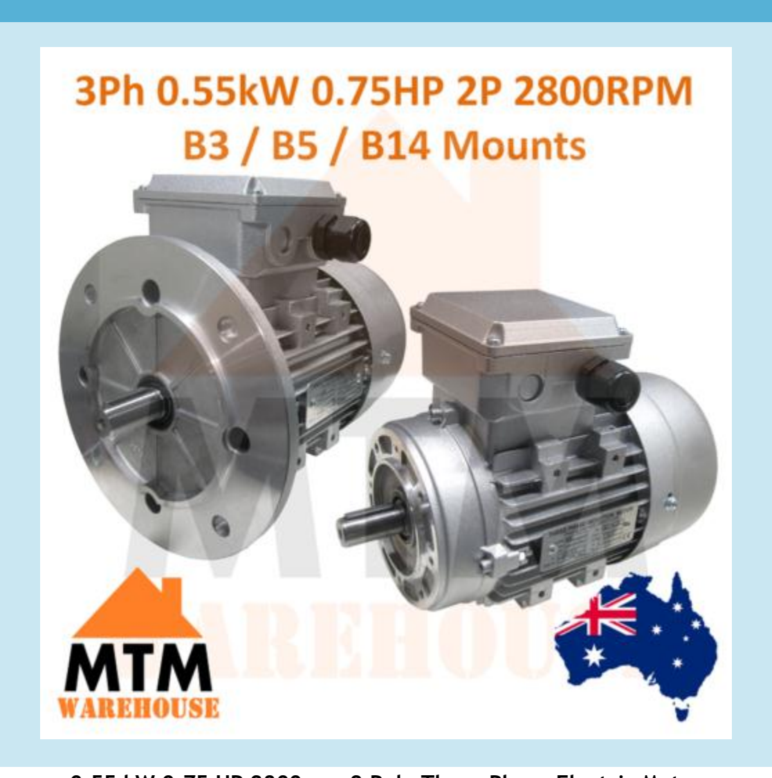
0.55 kW 0.75 HP 2800rpm 2 Pole Three Phase Electric Motor

Three Phase Electric Motor 0.55Kw 0.75HP 2800rpm