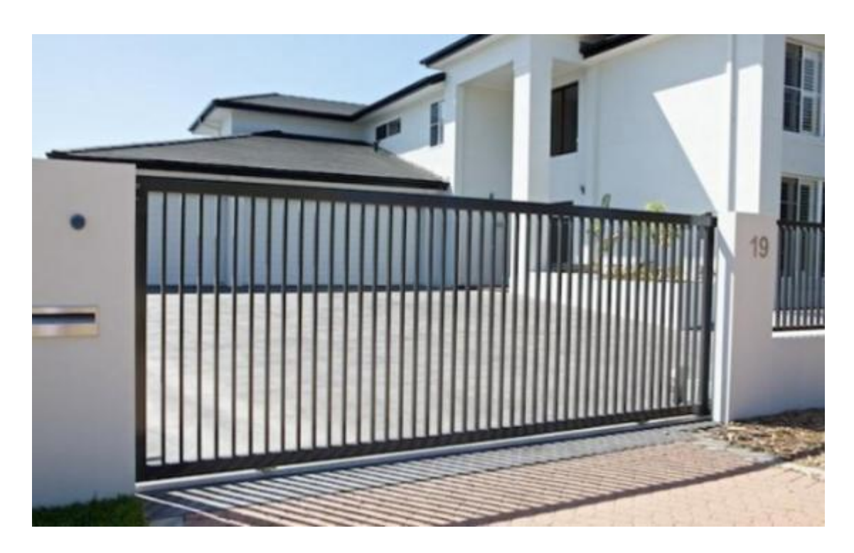
Sliding Gate Nylon Block/Guide

Our Sliding Gate Nylon block/guide is a very high quality part for fixing up your existing gate or installing a new gate.