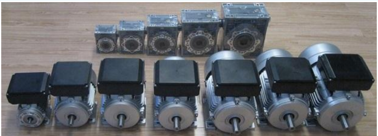
Worm Gearbox Type 50 B14 63 Input Flange 1:60 Ratio 60 Reduction

Worm Gearbox B14 Input Flange Type 50 1:60 Reduction