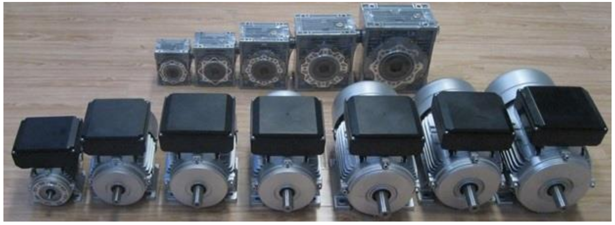
Worm Gearbox Type 50 B14 63 Input Flange 1:30 Ratio 30 Reduction