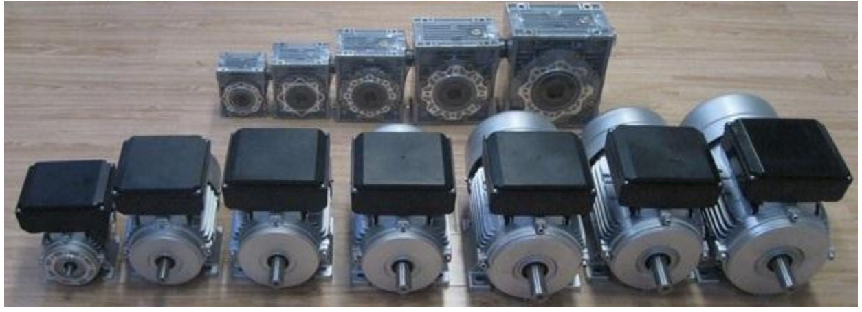
Worm Gearbox All Ratio Reduction

Worm Gearbox Industrial Type 063 B14 80 Replaces NMRV