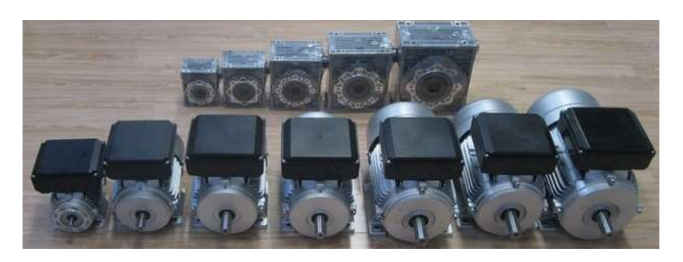
Type 63 Worm Gearbox Double Output shaft 25mm