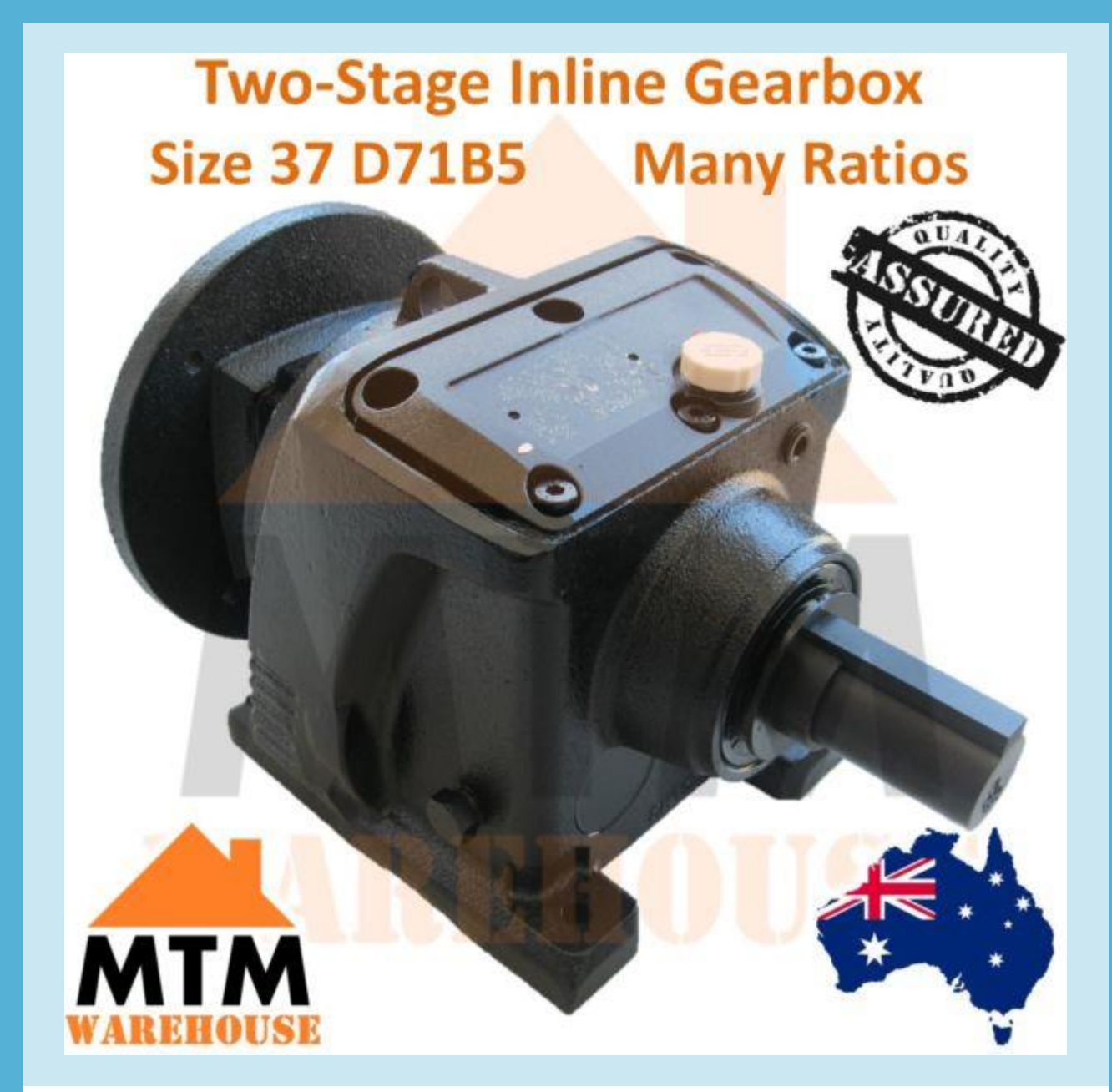
Type 2R37 Gearbox Helical Inline Gearbox Reducer D71B5 Many Ratios