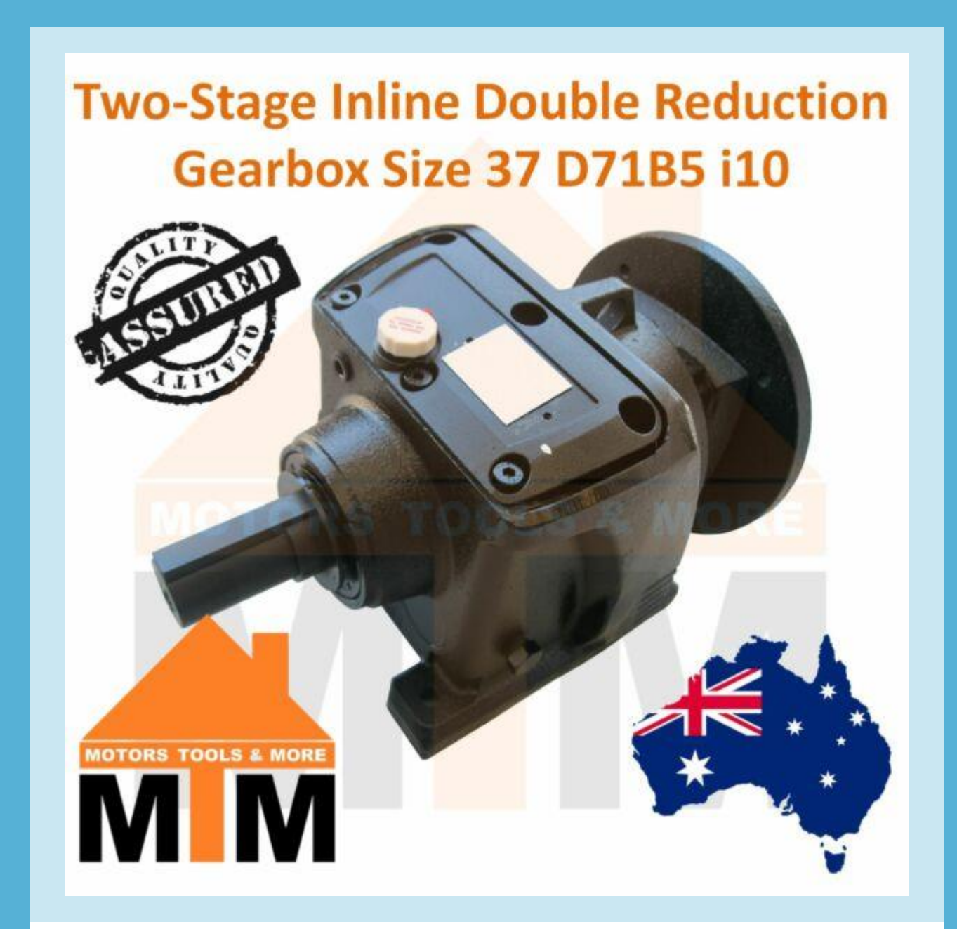
Type 2R37 Gearbox Helical Inline Gearbox Reducer i10 D71B5 Ratio 1:10 Reduction