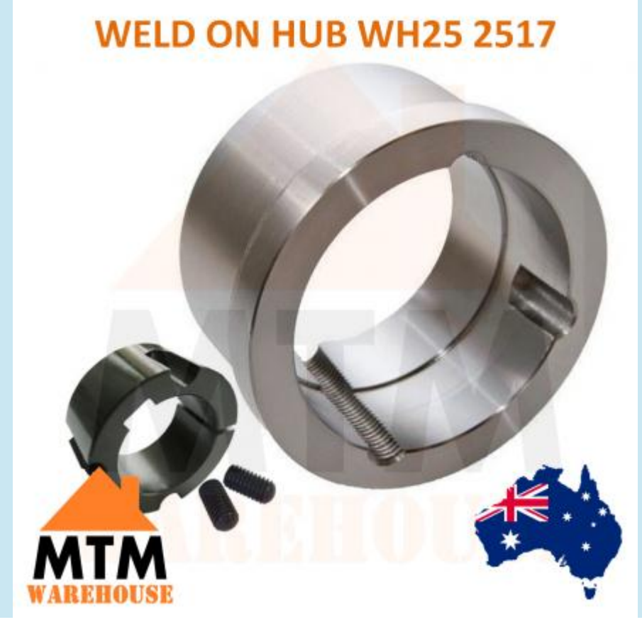
Taper Lock Weld on Hub WH25 2517 Bush Any Bore Size - Imperial / Metric

Please select a Bore Size from the drop-down box.