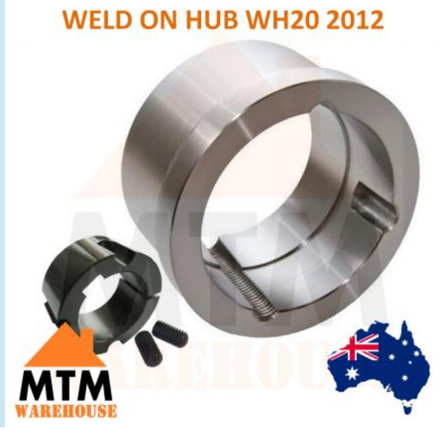
Taper Lock Weld on Hub WH20 2012 Bush Any Bore Size - Imperial / Metric

Please select a Bore Size from the drop-down box.