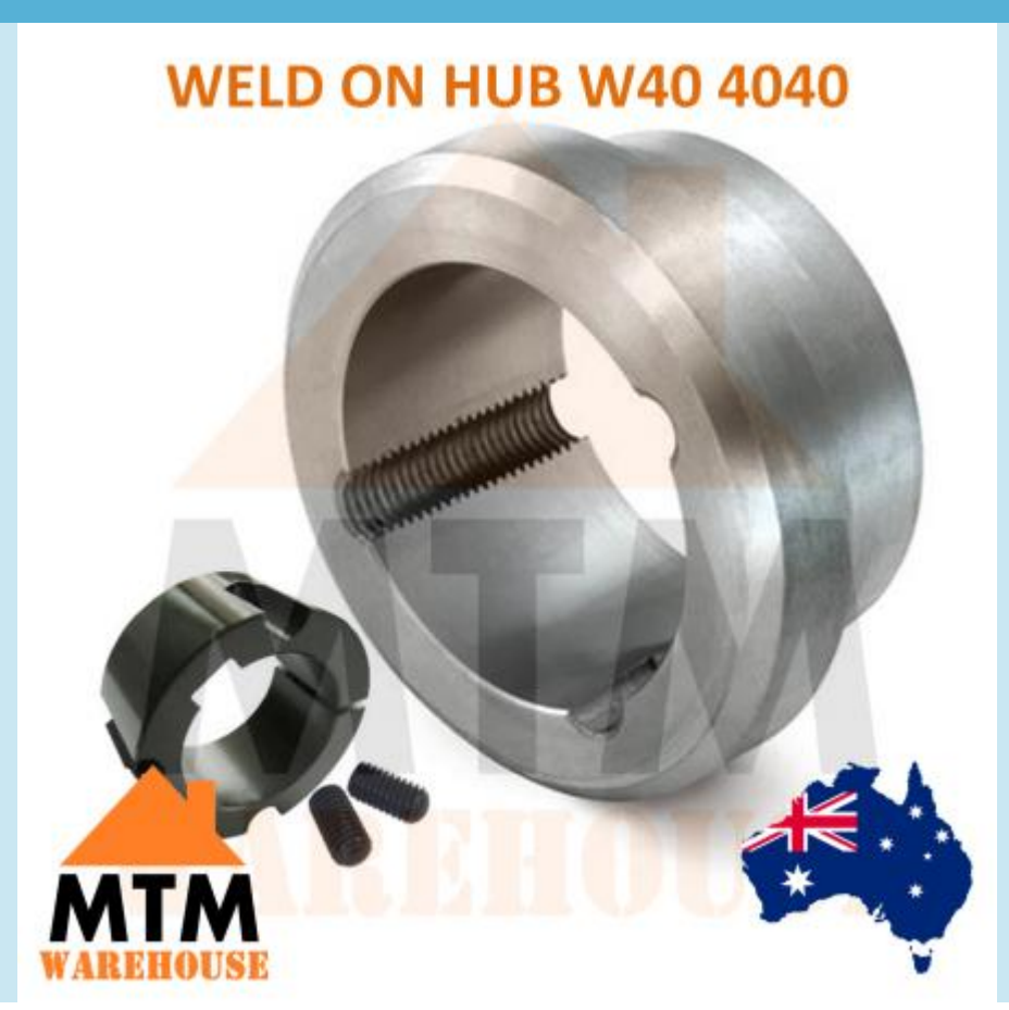
Please select a Bore Size from the drop-down box.