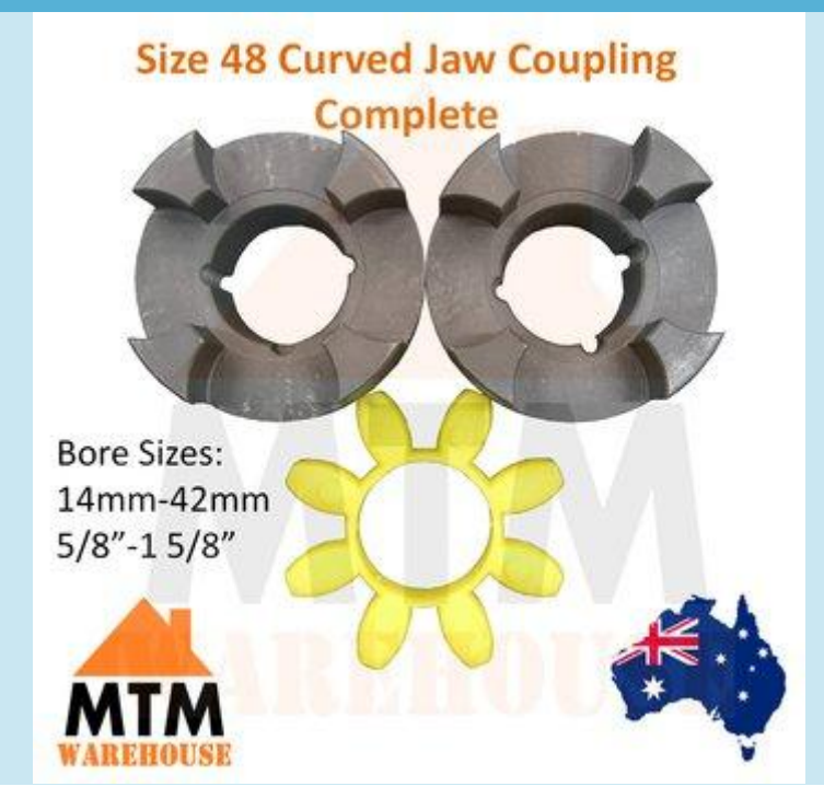
Size 48 Curved Jaw Coupling

Please select Bore Sizes below and message desired sizes upon checkout