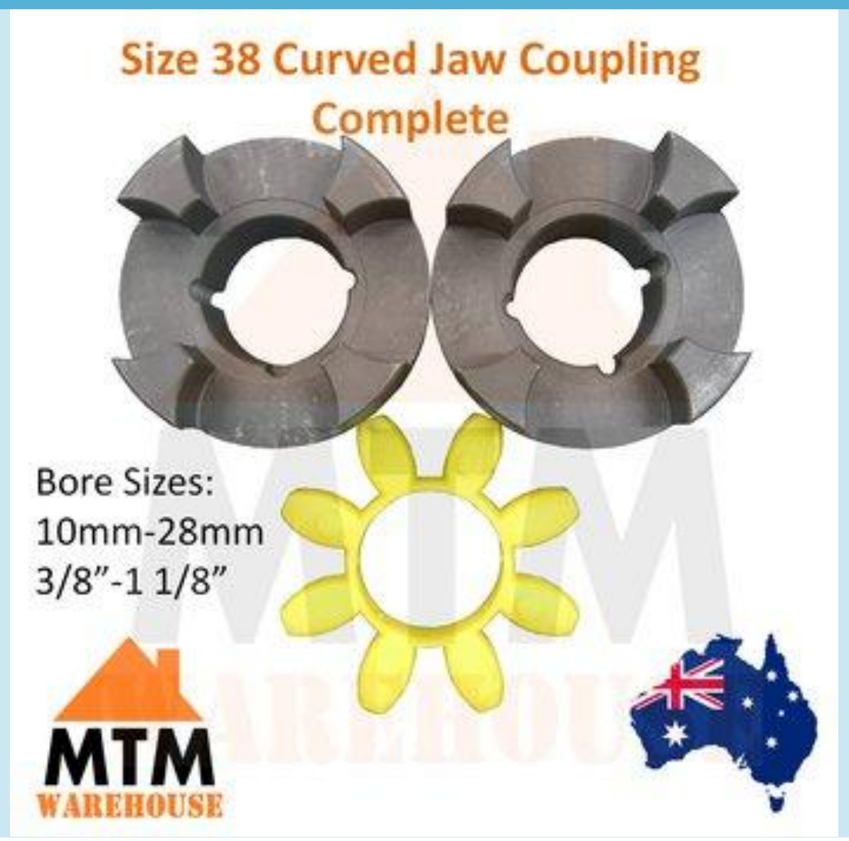
Size 38 Curved Jaw Coupling

Please select Bore Sizes below and message desired sizes upon checkout