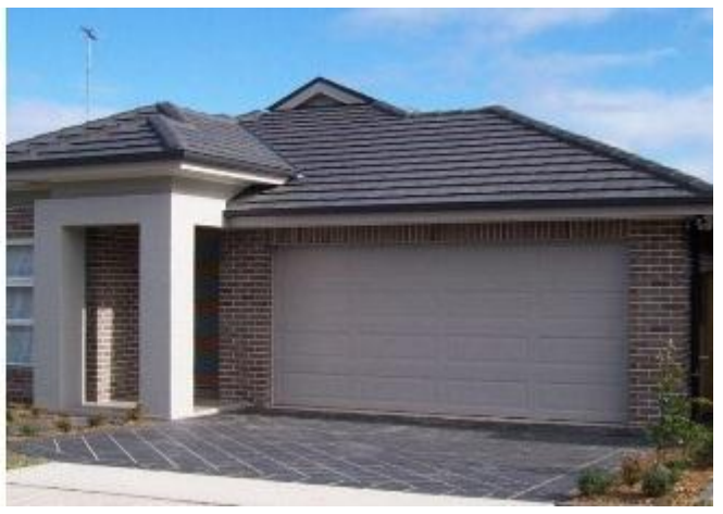
Sectional Panel Garage Door Nylon Roller Wheel Specifications: