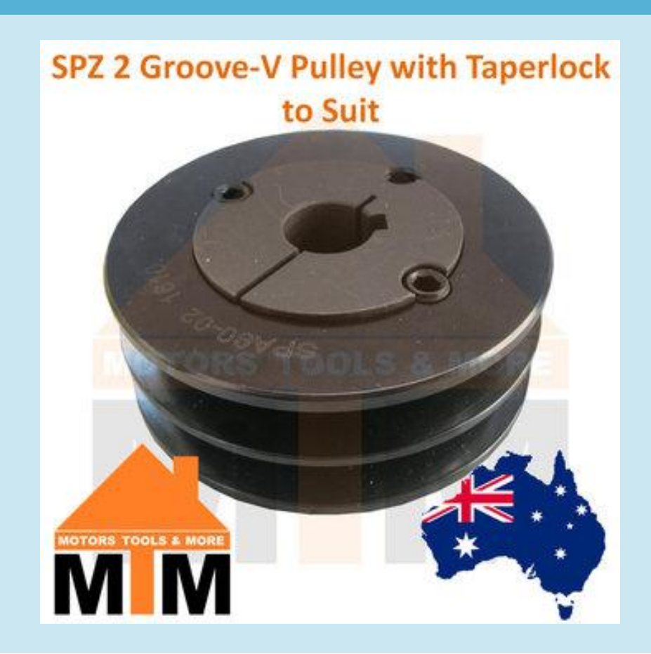
SPZ-2 Groove Industrial V Belt Pulley

This listing is for SPZ-2 Groove pulley with taperlock to suit.