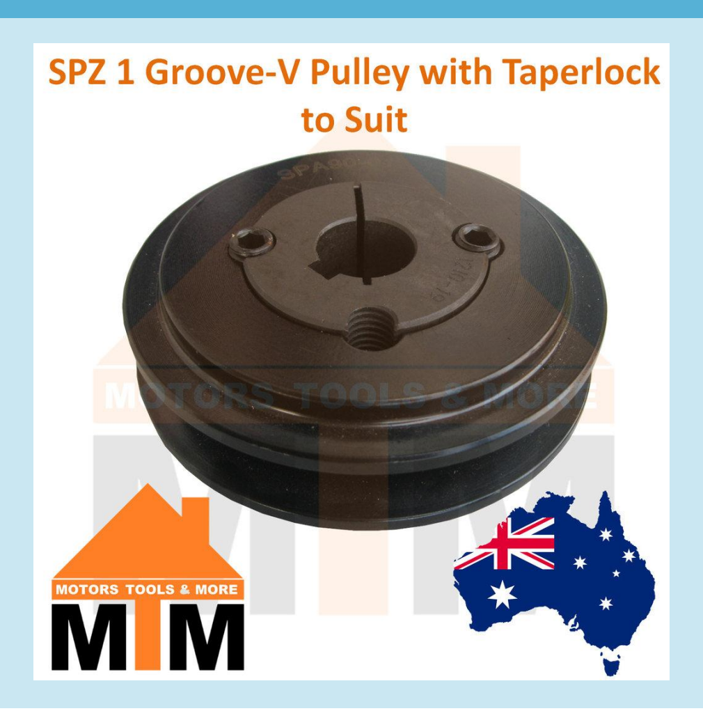
SPZ-1 Groove Industrial V Belt Pulley

This listing is for SPZ-1 Groove pulley with taperlock to suit.