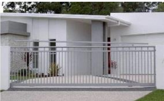
ATA NEOSLIDER NES 500 Slide Gate Motor WITH ATA Smart Phone Control Unit Kit

The next generation of gate openers has arrived. The NeoSlider 500 delivers increased gate weight