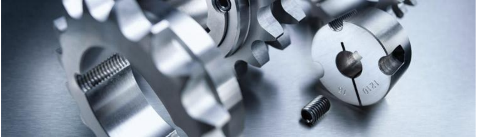
Plate Wheel Sprockets

British Standard high quality steel sprockets. Complete with induction hardened teeth, thus improving the sprockets resistance to wear and increasing the sprockets working life.