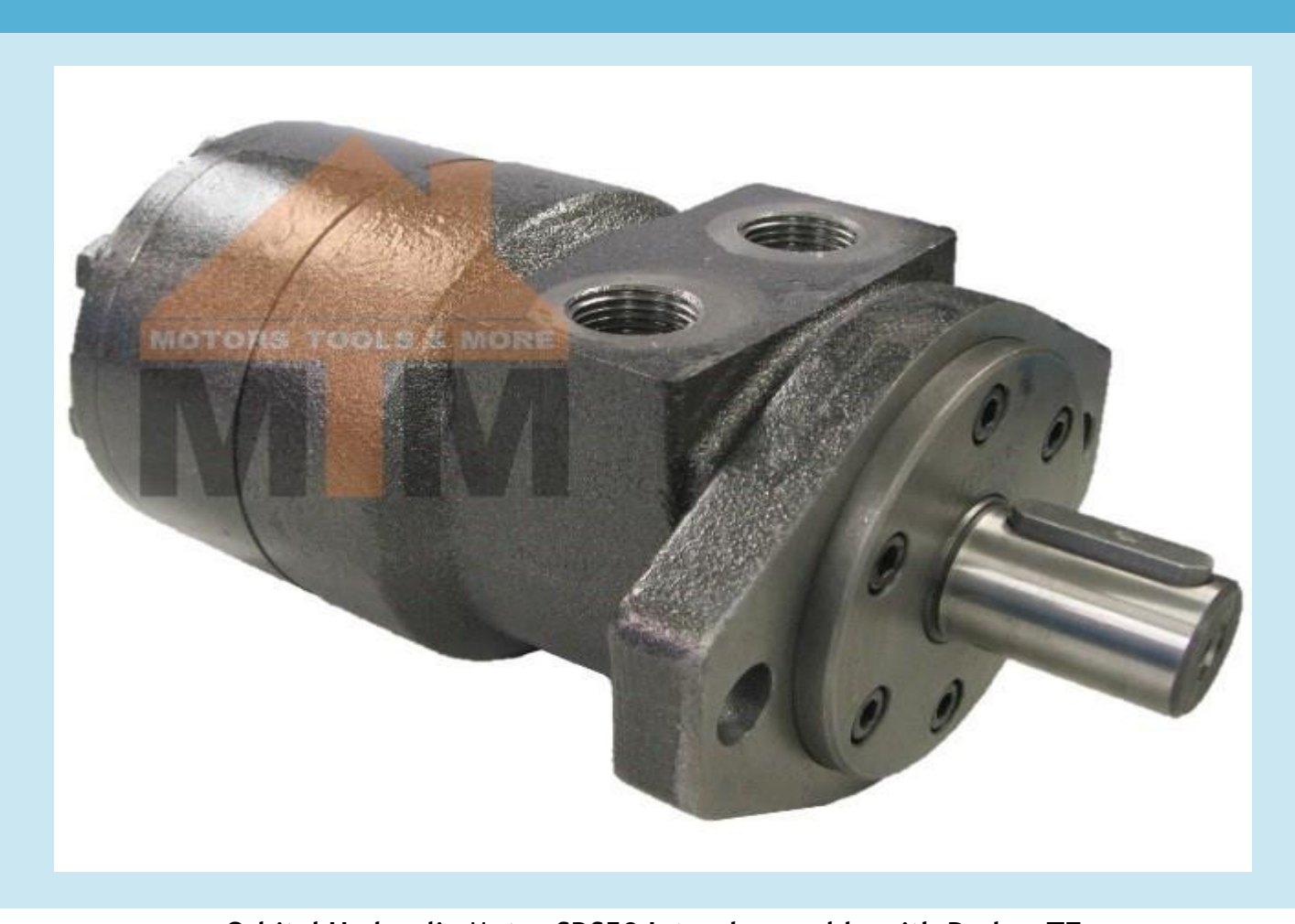
Orbital Hydraulic Motor SDS50 Interchangeable with Parker TF