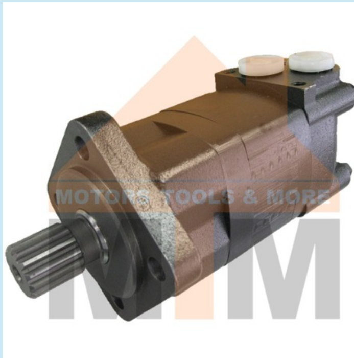
Orbital Hydraulic Motor SDH60 Interchangeable with Parker TB