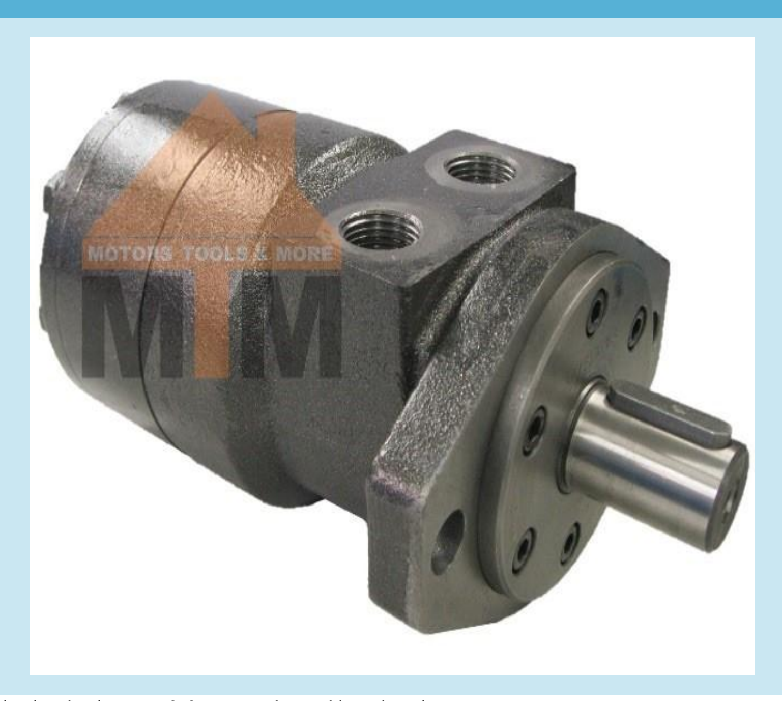
Orbital Hydraulic Motor SDS250 Interchangeable with Parker TF