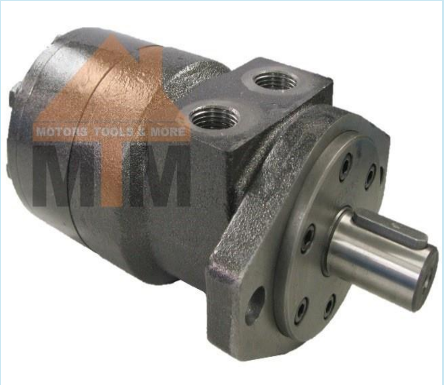
Orbital Hydraulic Motor SDS50 Interchangeable with Danfoss DS, White Cross RE