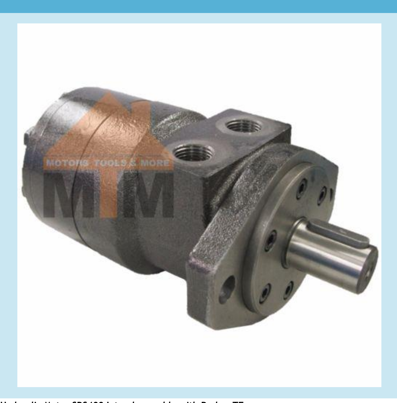
Orbital Hydraulic Motor SDS400 Interchangeable with Parker TF