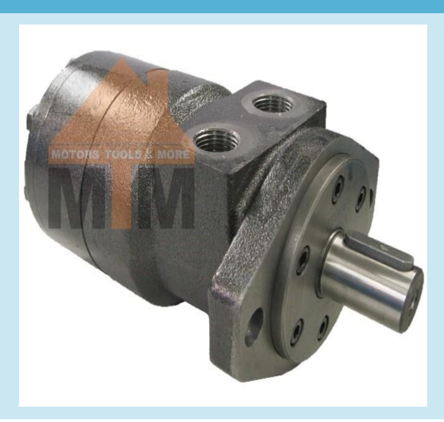
Orbital Hydraulic Motor SDS160 Interchangeable with Danfoss DS, White Cross RE