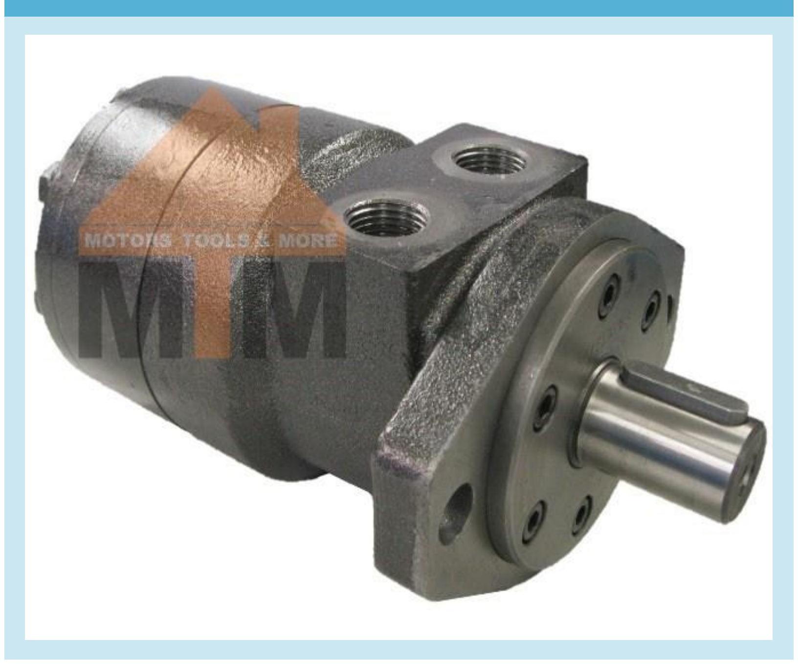
Orbital Hydraulic Motor SDS50 Interchangeable with Parker TF