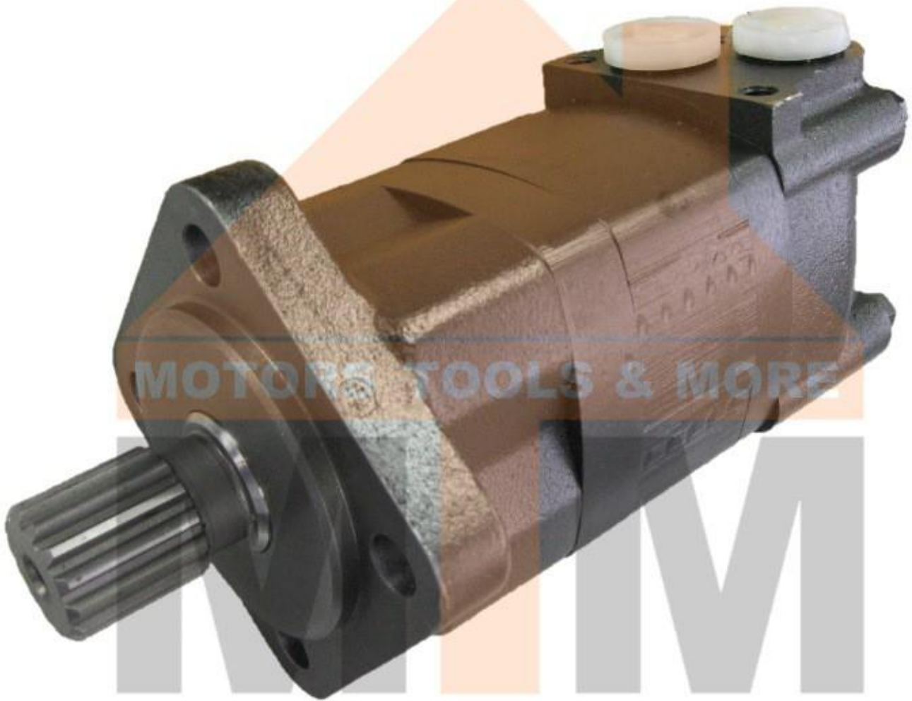
Orbital Hydraulic Motor SMR200 Replaces Danfoss OMR 200, Ross TRW MB