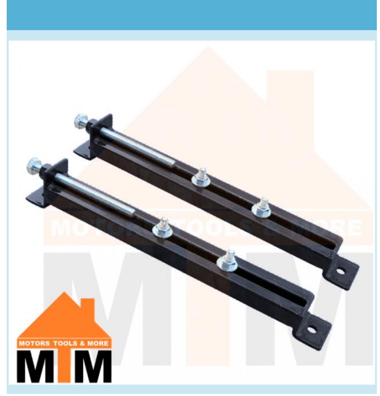
Motor Slide Rails

Devices that use chains, drive belts or friction drives will eventually require re-tensioning. The vibrations and friction can induce slippage and unnecessary wear on belts and electric motors.