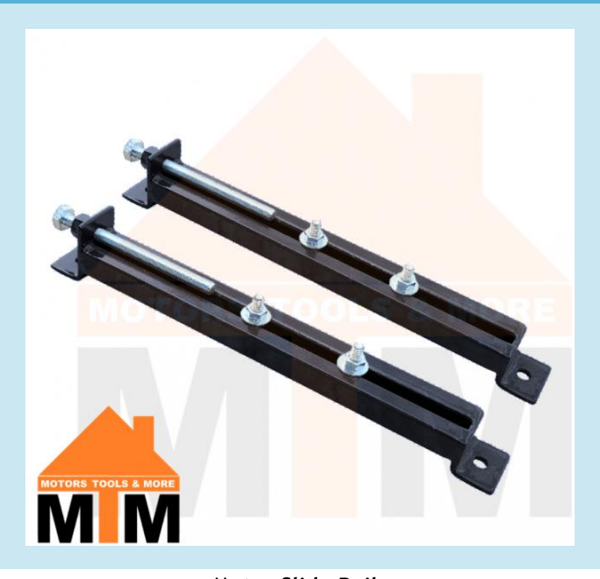
Motor Slide Rails

Devices that use chains, drive belts or friction drives will eventually require re-tensioning. The vibrations and friction can induce slippage and unnecessary wear on belts and electric motors. Slide rails or slide bases can significantly alleviate this issue through adjusting electric motors. Some possible applications for these products: compressors, fans, pumps, conveyors and more.