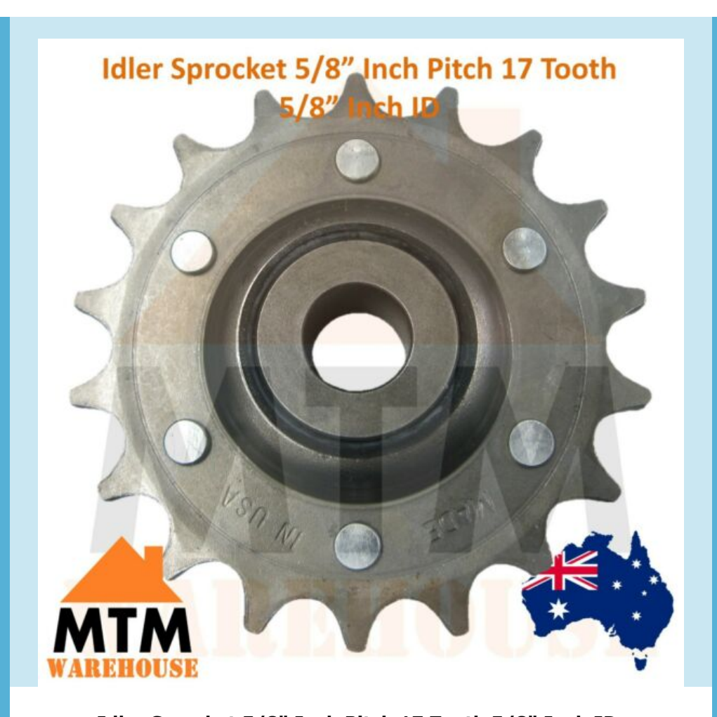
Idler Sprocket 5/8" Inch Pitch 17 Tooth 5/8" Inch ID

This listing is for one Idler Sprocket 5/8" Inch Pitch 17 Tooth 5/8" Inch ID.