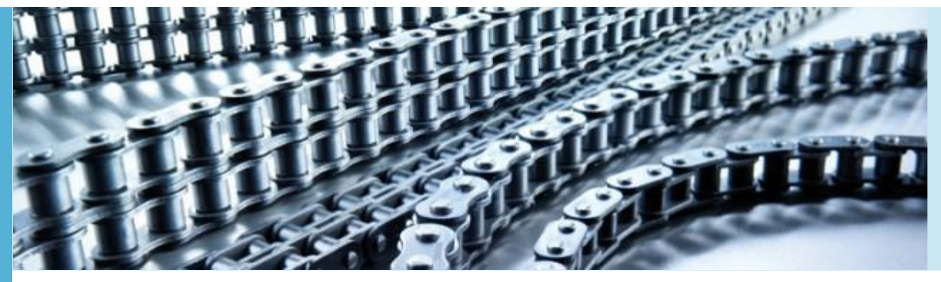
12B Simplex Chain 10ft/3m Box

INDUSTRIAL ROLLER CHAIN 12B-1 - 3/4" PITCH SIMPLEX 10Ft 3m Box 12B