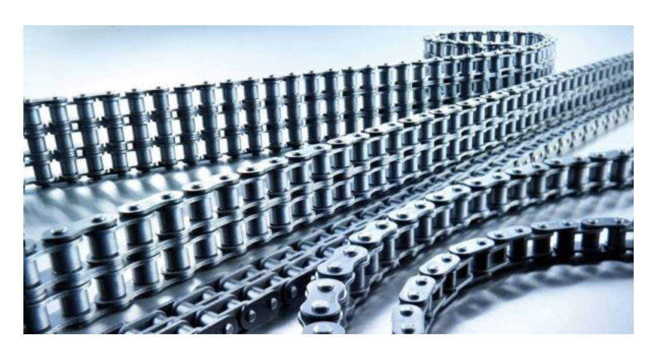
British Standard Roller Chain 10ft/3m