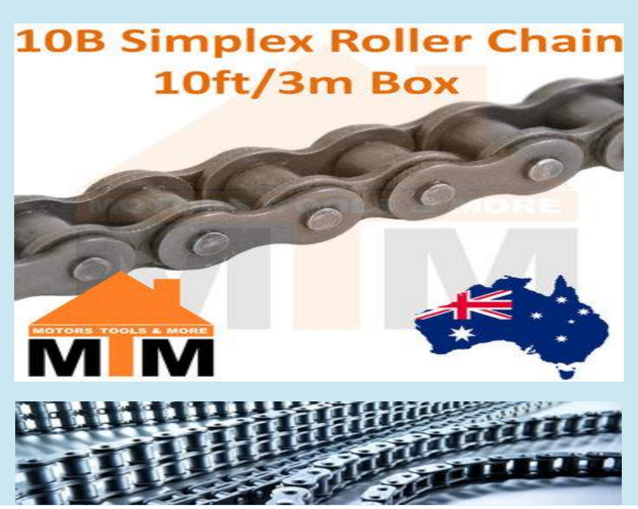
10B Simplex Chain 10ft/3m Box

INDUSTRIAL ROLLER CHAIN 10B-1 - 5/8" PITCH SIMPLEX 10Ft 3m Box