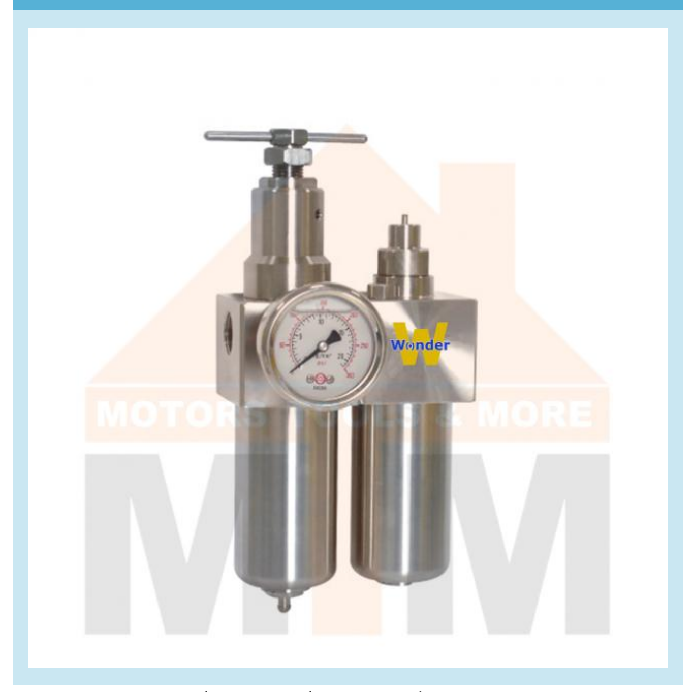
Filter Regulator + Lubricator