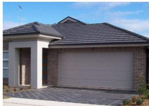
Eye Opener Slide Gate Sectional Garage Panel Door Opener Motor with WiFi Camera

THE EYE OPENER MOTORS ARE NOW AVAILABLE TO ORDER!!!