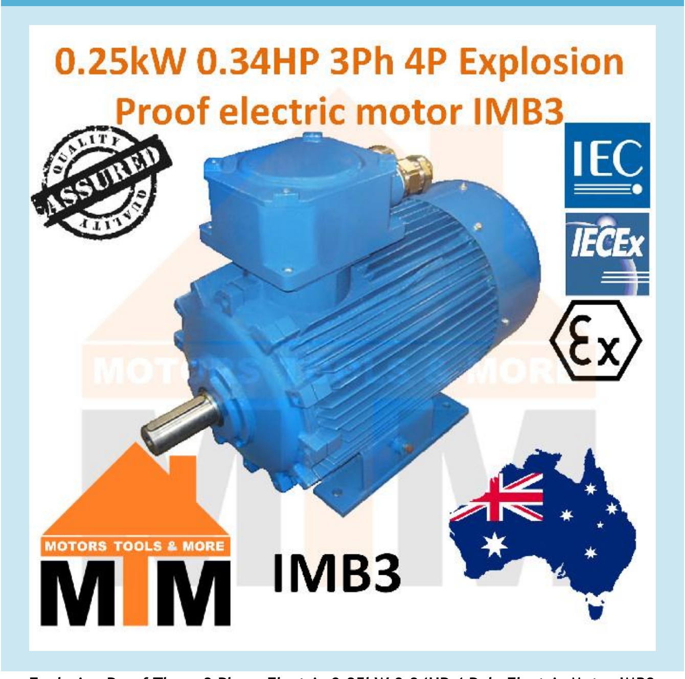
Explosion Proof Three 3 Phase Electric 0.25kW 0.34HP 4 Pole Electric Motor IMB3