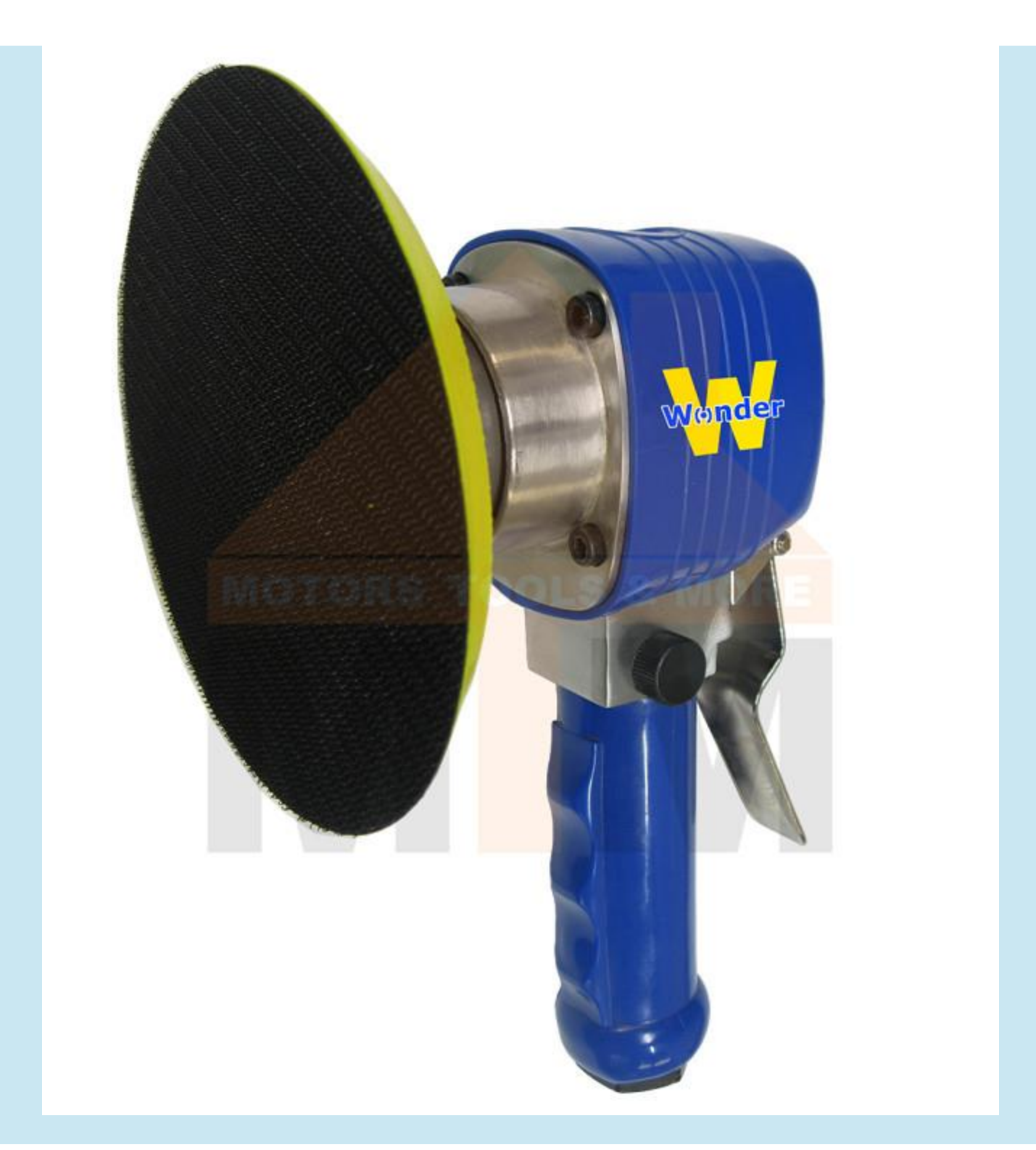
6" Dual Action Air Sander

Sander Exhaust ight and durable die cast aluminium body with soft grip.