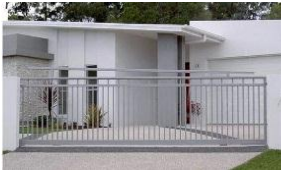
Slide Gate Motor - 600kg Slide Gate Opener