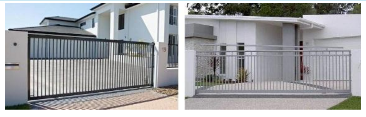
Slide Gate Motor - 600kg Slide Gate Opener with Courtesy Light