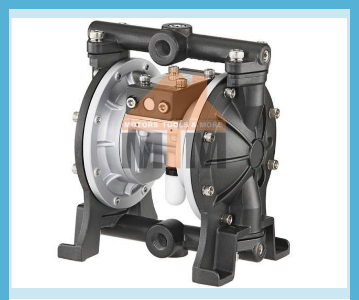
3/8" Aluminum Double Diaphragm Air Pneumatic Pump 32 LPM