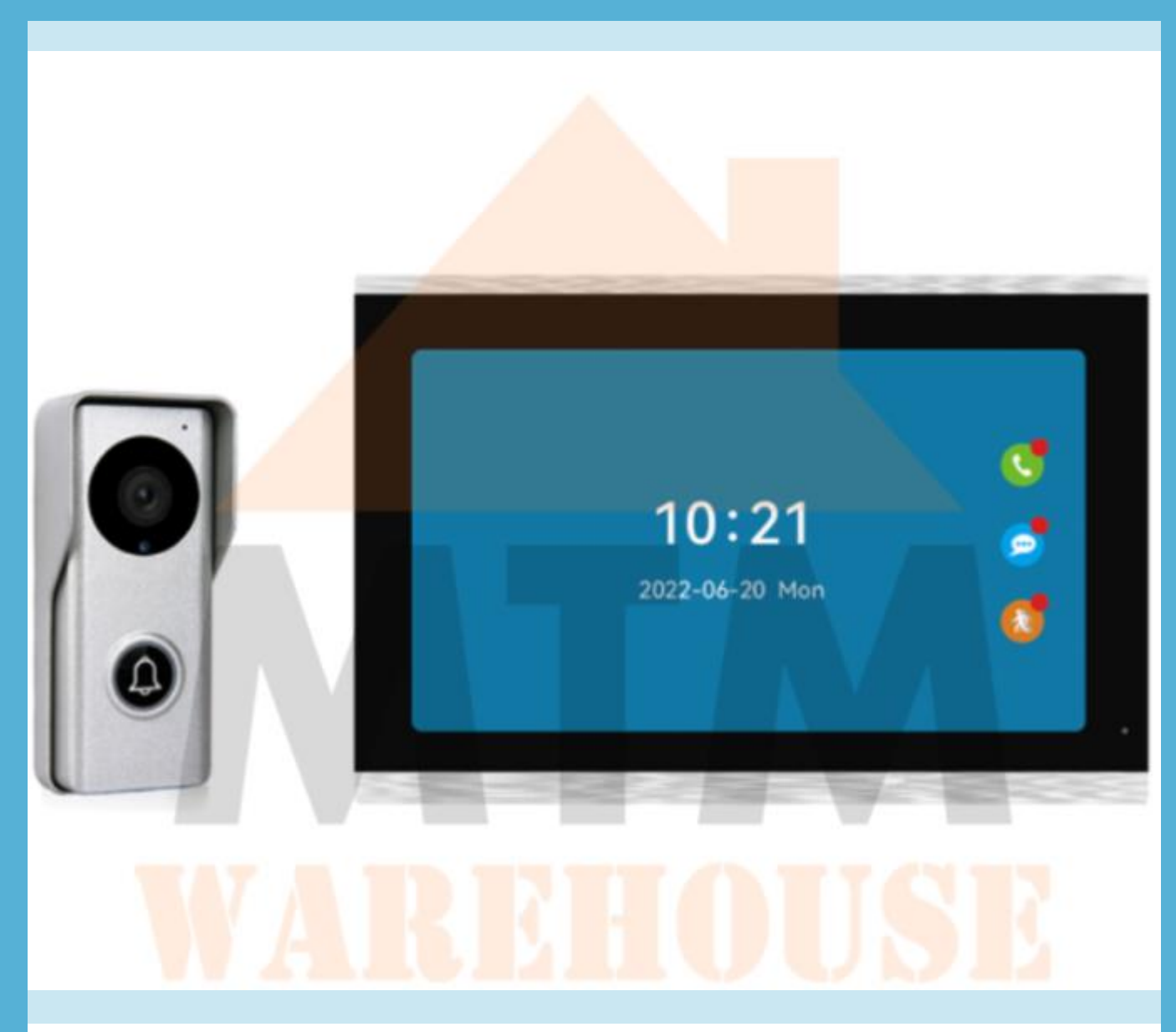
[EXTRA] 10" Inch Colour AHD Intercom Monitor Screen

This 1080P Video Doorbell with an HD Camera designed for convenience. This innovative system features a 10-inch Touch Monitor, offering one-key unlock and advanced motion detection. Connect multiple doorbells to indoor monitors, enabling seamless dual-way communication and call transfer. Use your phone with the installed application as a key for convenient unlocking, ensuring you never miss a visitor or delivery. The system boasts one-button unlock for electronic locks, multiple ringtones, and a rainproof, dustproof design for reliable performance in all weather conditions. A 10-inch screen for a simple and comfortable interface, making settings adjustments a breeze. Elevate your home security with this sleek, smart, and user-friendly solution.