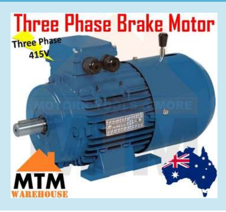
7.5kW 10HP 1400rpm 4 Pole Three Phase Brake Motor

Three Phase Brake Motor 7.5Kw 10HP 1400rpm